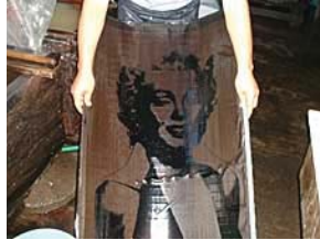
Mechanical (Layed-out) Set