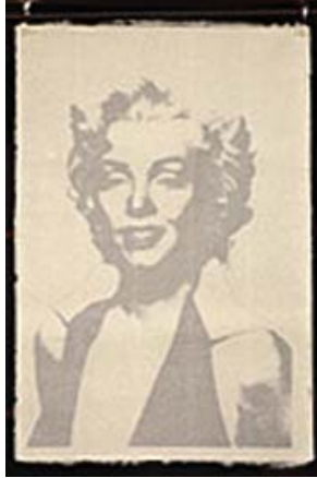
On Black Background (24"x 36")