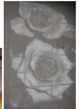
Design Example - Roses