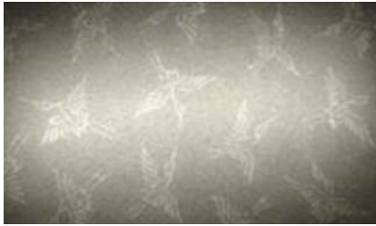
Pattern Example - Cranes