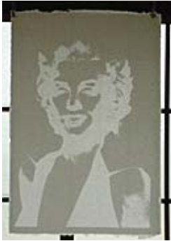
Through the light (24"x 36")