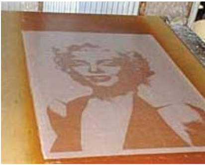
Wet parchment in a vat