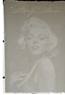
Through the light (24"x 36")