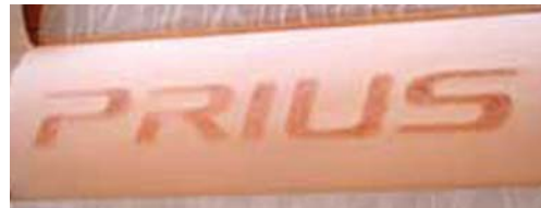
TOYOTA PRIUS LOGO (24"x 96")

Standard sheet A: 24" X 36" (600mm X 900mm) Extra Large sheet: 82" X 118" (2100mm X 3000mm)