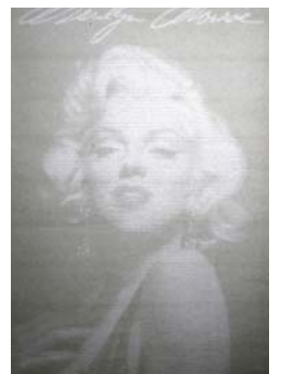
Marilyn Monroe Type B (24" x 36")