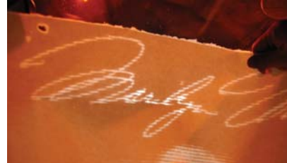
Detail For Letters