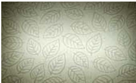
Pattern Example - Leaves