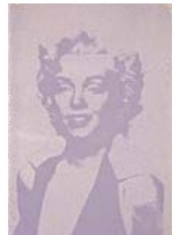
Marilyn Monroe Type A (24" x 36")