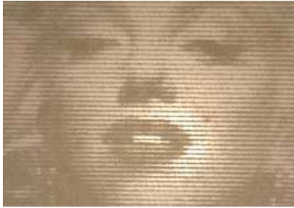
Detail For Artwork