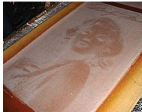
Wet parchment in a vat