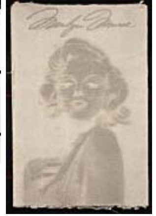
On Black Background (24"x 36")