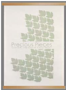
Wall Hanging (24"x 36")

A watermark is a recognizable image or pattern in paper that appears lighter when viewed by transmitted light (or darker when viewed by reflected light, atop a dark background)