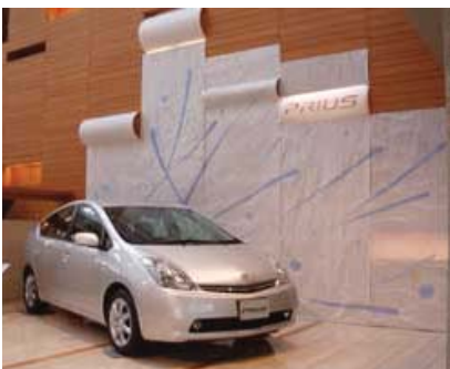
TOYOTA PRIUS LOGO

This embossing is transferred to the natural fibres, compressing and reducing their thickness in that area. Because the patterned portion of the page is thinner, it transmits more light through and therefore has a lighter appearance than the surrounding paper. If these lines are distinct and parallel, and/or there is no watermark, then the parchment is termed laid parchment. This method is called "filtered"