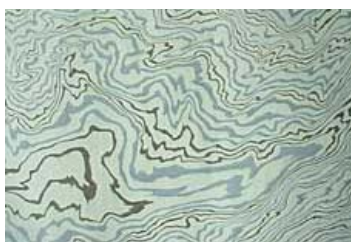
7. 墨と青の古典的な二色柄 B (弱いコントラスト)

Light ink pattern with wide space between the lines