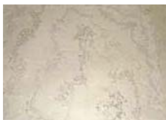
3. 墨(淡色)による全体柄 (間隔を広く開けて)

Traditional black and blue ink pattern A (Strong contrast pattern)