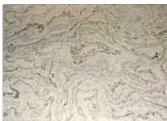
2. 墨(濃淡)による全体柄 (少し間隔を開けて)

Three light colors (black, red, and blue) pattern on right and left sides only (blank space on center)