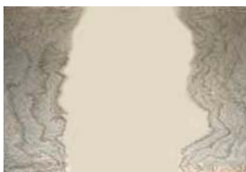
5. 墨、赤、青の三淡色による 左右柄 (中央空白)

Black ink shading pattern on entire sheet