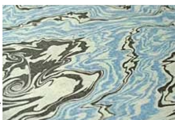
6. 墨と青の古典的な二色柄 A (強いコントラスト)

Black ink shading pattern with slightly wider space between the lines